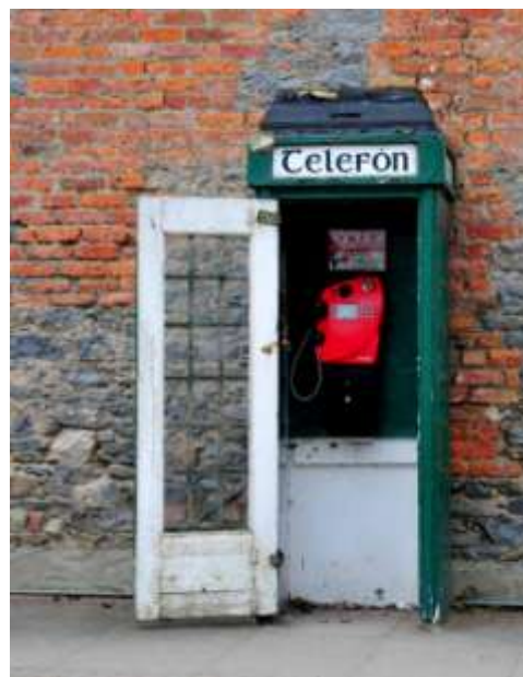
Irish Phone Booth