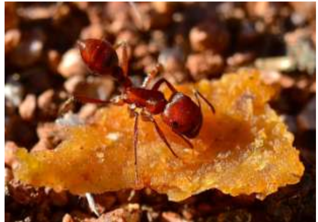
Sonoran Desert Ant July 2011