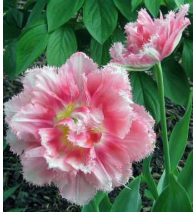
Spring Duo © 2012 Charissa Lansing