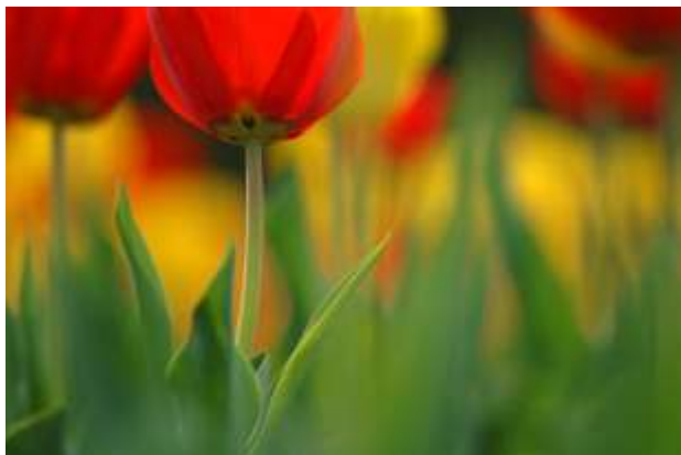
Colors of Spring