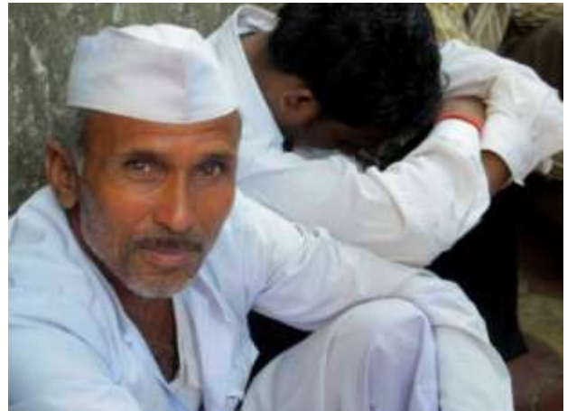
Mumbai Man © 2012 Casey Diana