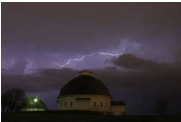
Round Barn Lightning