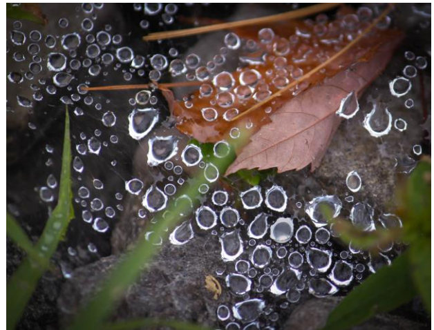
Morning Dew