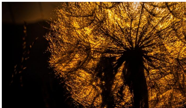
Oyster © 2012 Gail Snowden