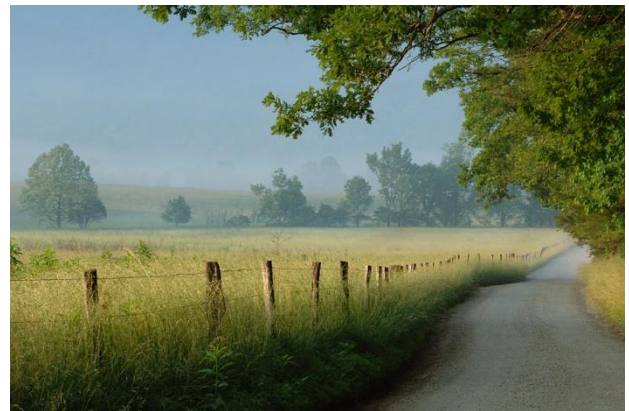
Cades Cove 2

The schedule is subject to change, although generally few changes have been made to the schedule. We will meet in Turner Hall but will not have confirmation until later for the 2012 dates. All meetings are on Monday evening and begin at 7:30pm unless otherwise noted.