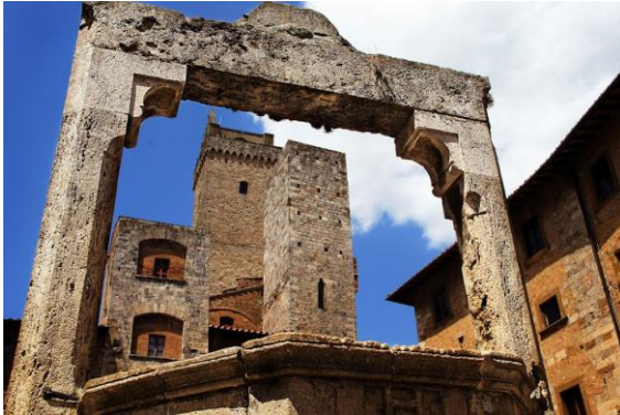
Samignano

May 10. I-74 Challenge – Theme: Monochrome (P-R).