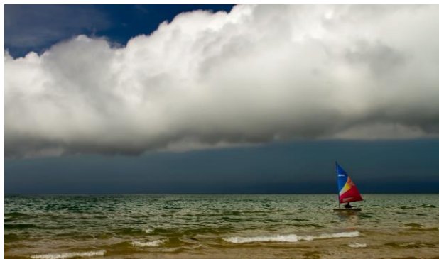
Running Before the Storm