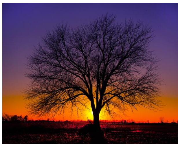
Illinois Sky

May 9. I-74 Challenge. Subject: Water, any form. Images have to be taken after May 10, 2013. The competition will take place at the First United Methodist Church, 211 N School Street, Normal, IL.