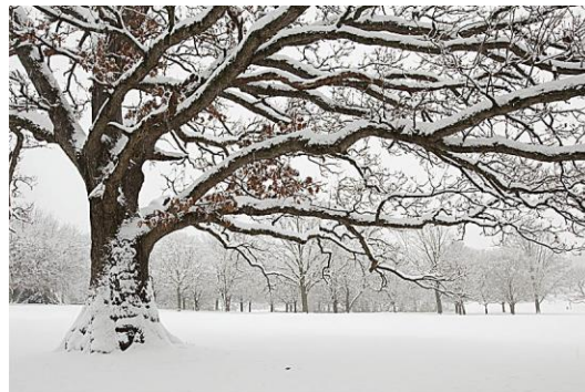
Lone Oak

April 21. Planning the 2014-2015 club program