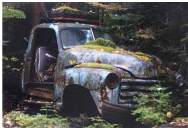
The Old Truck First Place Best in Show and First Place General Best in Show Print Competition February 2010

The Club hosted its ninth consecutive annual Best in Show Print Competition at Lincoln Square Village from February 20 through February 28. Approximately 15 persons, including about 12 from the Club, worked on