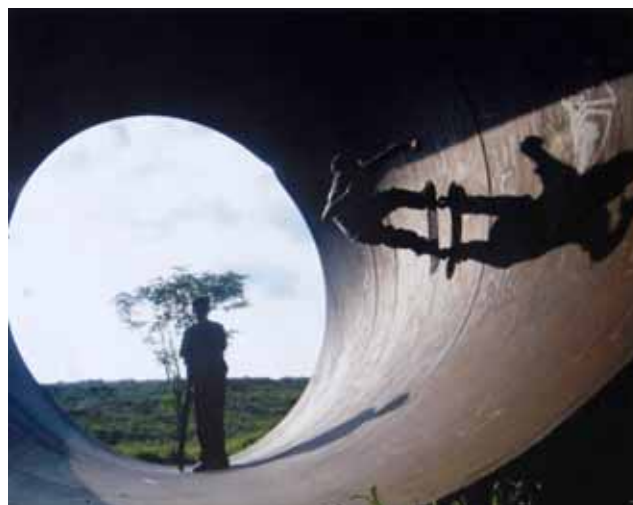
Vertical Second Place Best in Show and First Place People Best in Show Print Competition February 2010

This year 203 photographers entered 513 prints. Cash and gift certificates worth over $2100 were awarded to the contestants receiving a ribbon.