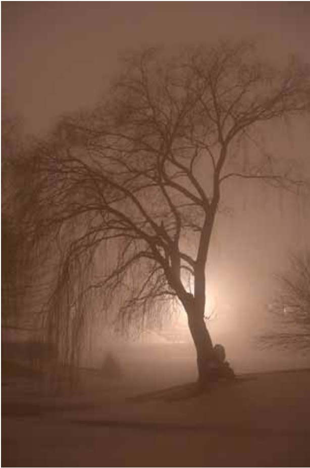
Foglight First Place Light Category CCCC Digital Competition, February 22, 2010