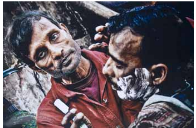
You Got the Look Fourth Place Best in Show, Second Place People Best in Show Print Competition, February 2010