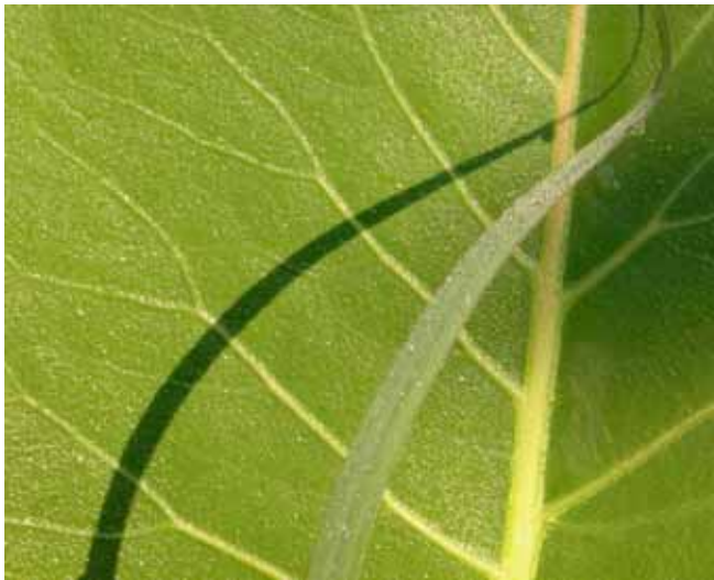
Silphium Shadow HM i2007 I-74 Challenge, Curves

Note on photos appearing in this newsletter. Most of the highest rated digital image from our CCCC April Salon and the I-74 Challenge have already been published in one of our newsletters. Many appeared in our Summer Newsletter and some appeared in earlier newsletters due to their success in earlier club competitions. Still, members have taken a great many outstanding photos that did not have the highest places in the Salon or the Challenge. Your editor has selected a number of these, some with places and some with HM's, for inclusion in this newsletter. As with any publication, the material included in this newsletter reflects to a great extent your editor's tastes. We do look forward to seeing new outstanding images this coming year and these, of course, will appear in future newsletters throughout the year.