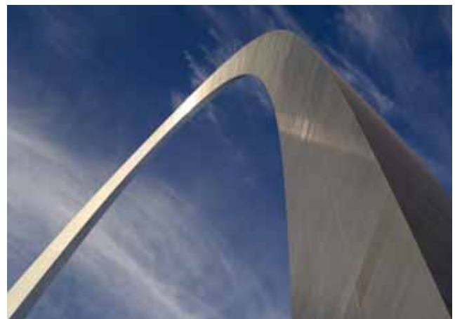
The Arch HM in 2007 I-74 Challenge, Curves

Category: Patterns. This Challenge will be held in Bloomington, most likely at the National City Bank Center in downtown Bloomington. Photo editing will have the same limitations as we had for this past May's Challenge on Curves.