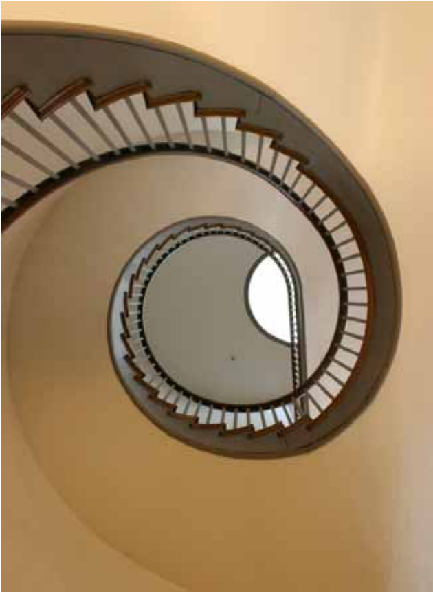
Stairway to Heaven © 2007 Barb Sandell HM 2007 I-74 Challenge, Curves

Monday, February 25, 7:30 PM. Digital Competition. A. Landscapes/Waterscapes. B. Texture. C. Non-Flower Flora.