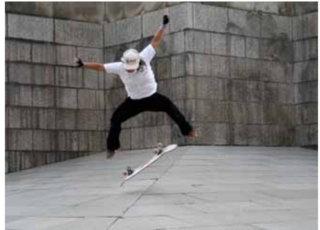
Airborne Fourth Place 2007 Salon Digital Category People

with judges, 5:30 PM. Showing of prints and digital images with comments from judges, 7 PM.