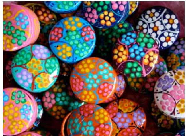
Market Pill Boxes HM i2007 I-74 Challenge, Curves