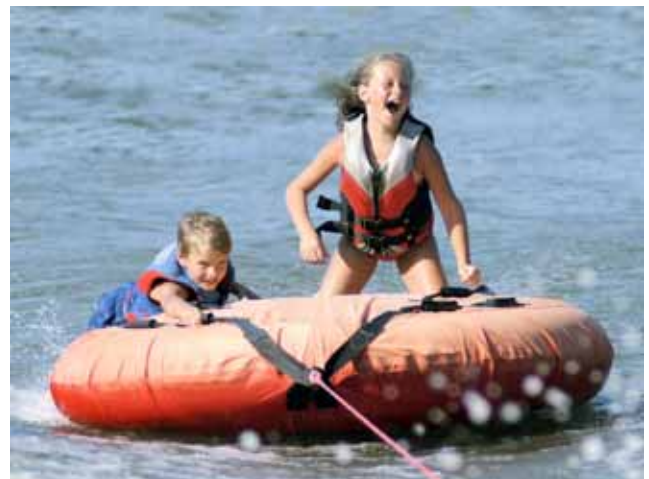
Faster, Faster © 2007 Ted Wetekemp HM 2007 Salon Digital Image Category People

PSA 2009 International Conference , West Yellowstone, MT, Sept. 20-26, 2009, Holiday Inn Sunspree Resort.