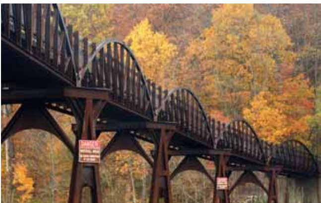
Bridge in Brown HM 2007 I-74 Challenge, Curves

Monday, December 3, 7:30 PM. Digital Competition. A. Diagonals. B. People. C. Creative/Contemporary. Category C is not a photo-realistic category.