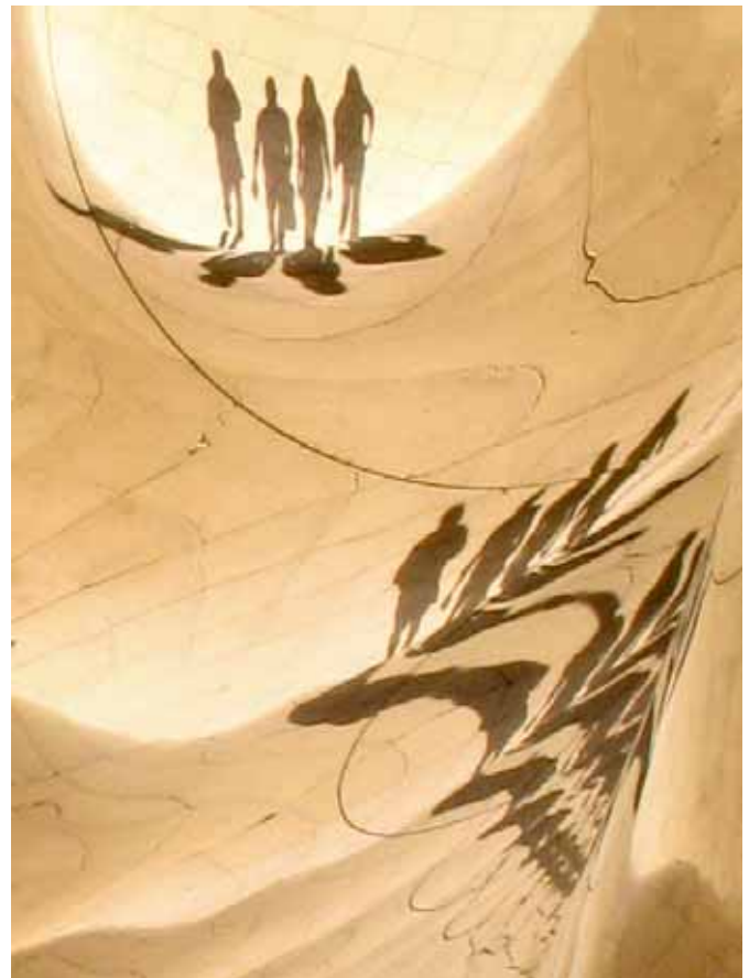
Shades First Place 2007 Salon Digital Image Category General

Monday, April 14, 7:30 PM. Digital Competition and Print Competition. Digital: A. Complementary Colors. B. I-74 Challenge category: Patterns. Prints: General competition. In category A, an image should primarily have two complementary colors, such as Blue and Yellow, Green and Magenta, Red and Cyan. Of course, using a color wheel, one easily sees there is infinity of complementary colors. Category A is not a photo-realistic category.