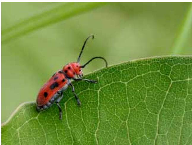
Milkweed Beetle © 2007 Gary Jackson HM 2007 Salon Digital Image Fauna Category

All categories in our digital competitions are to be treated as being photo-realistic except for three that are explicitly noted below; however, photo-realistic images may be entered in any of the categories that allow more strongly manipulated images. As a reminder, a Photo-Realistic Digital Image is a digital image in which the original photographic content predominates. While alteration of the image by the maker is permitted, the alteration should not predominate or be obvious. Blending of images from different scenes is prohibited.