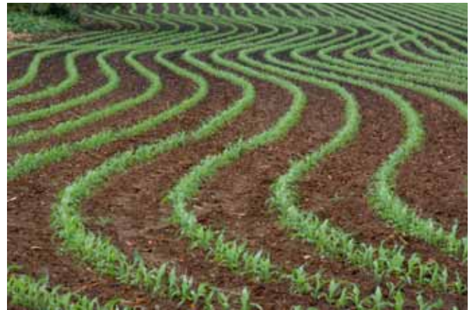
Corn Curls © 2007 Barry Brehm HM 2007 I-74 Challenge, Curves

PSA 2007 International Conference , Tucson, AZ, Sept. 2—8, 2007, Starr Pass Marriott Resort and Spa. For more information, see http://www.psa-photo.org and click Conferences in the list on the left side of the home page of PSA.