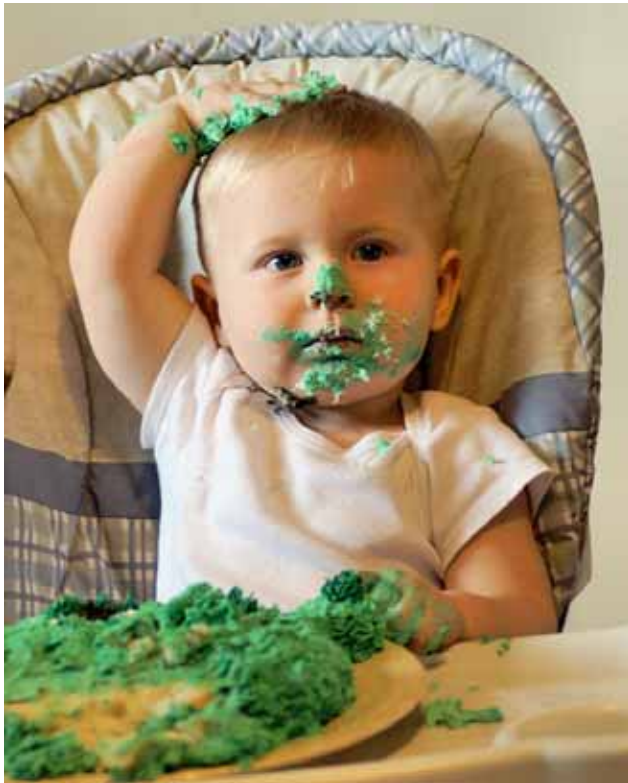
I'm Full Second in 2007 Salon Digital Image Category People

Wednesday, September 19, 7:30 PM. Photographic Composition. Members of the Club will comment on a number of images used in an interclub competition, stressing elements of strength and weakness, and commenting on ways to make the images stronger. In addition, we will view one or two bench shops by Radiant Vista in which composition is discussed.