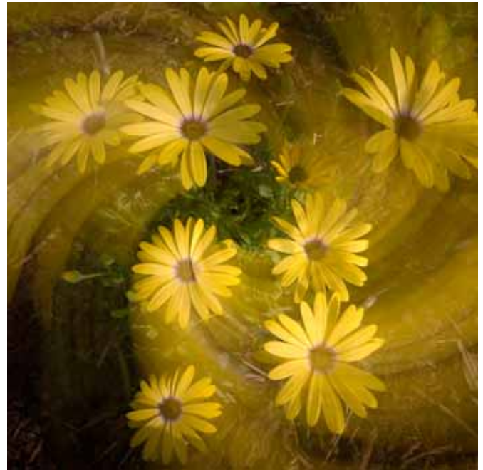
Flower Spiral © 2007 Jim Long HM 2007 I-74 Challenge, Curves

Club starts meeting in September, but people may wish to make room reservations once we hear back from Mary.