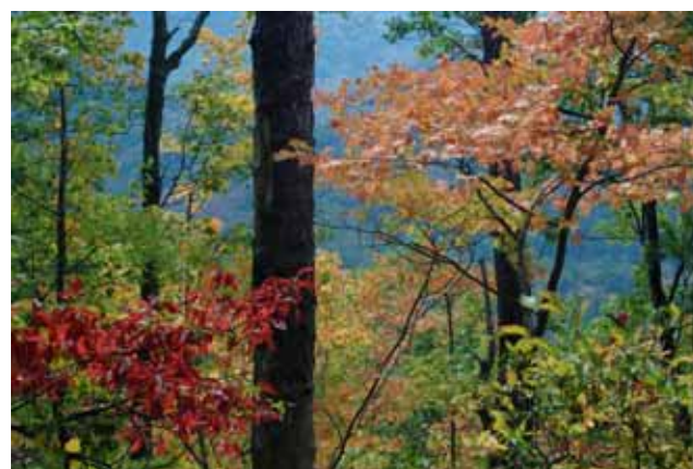
Smoky Mountain Detail Second Place in 2008 Salon Digital Image Landscape/Waterscape Category