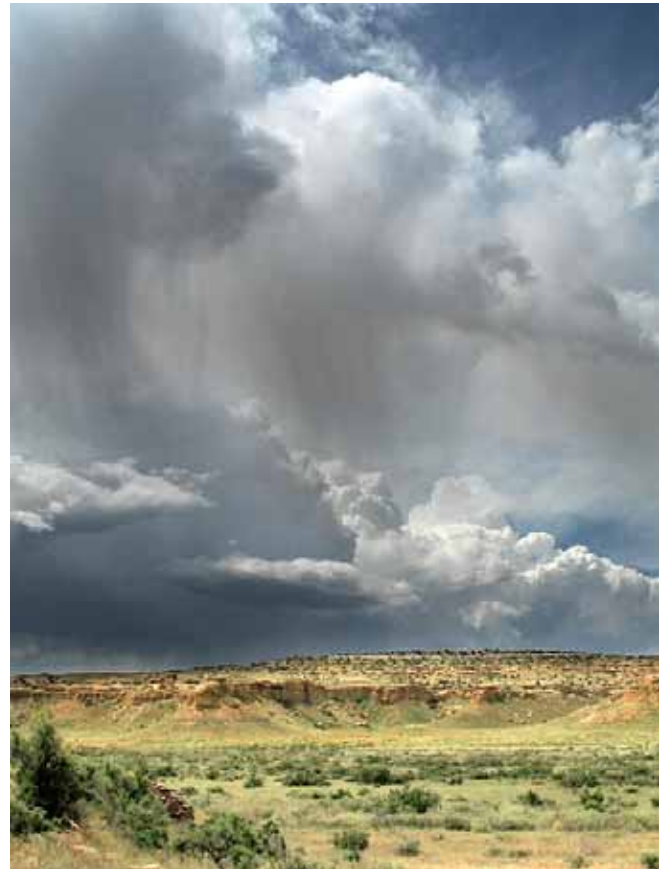
Storm Glow First Place in Digital Image Landscapes/Waterscapes Category CCCC Salon, April, 2008 Honors, Nature Category, CICA Individual Salon, May 3, 2008