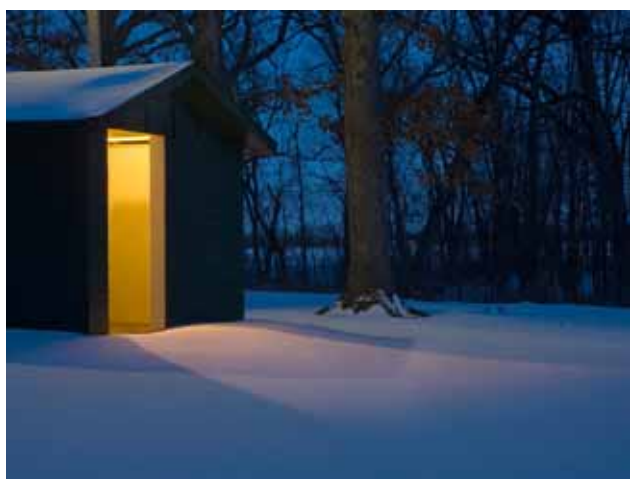
Lodge Park Loo Third in 2008 Salon Digital Image General Category First Place in Print Competition, April 14, '08

Friday, February 20, 4PM. Best in Show Competition, Lincoln Square Village. We will arrange the entries in the 2009 Best in Show Competition for display. Prints will be judged on Saturday, February 21, and the show will be open to the public from February 21 through 1 PM, Sunday, March 1. At that time, a public critique will be given by the judges.