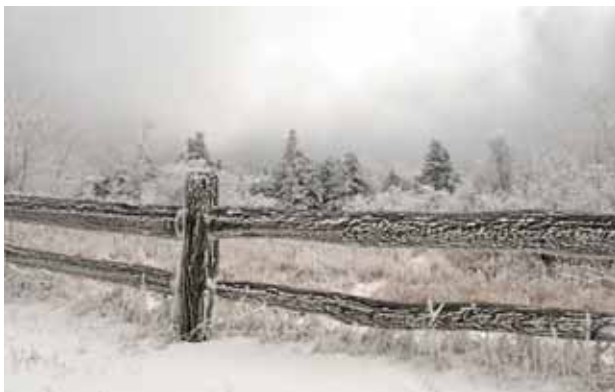
Roan Mountain

At the annual business meeting, the Club drew up a schedule for the new year that will start in September. Please note that all meetings will be held on Mondays this year except for our annual business meeting, the I-74 Challenge and the annual Club Salon.