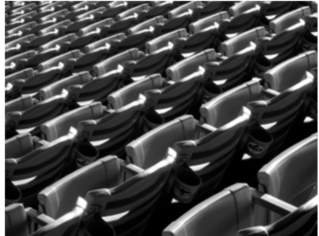
Stadium Seating © 2008 Jean Paley, CCCC First Place, I-74 Challenge, Patterns, May, 2008

This year's I-74 Challenge between the Bloomington-Normal Koda Roamers and the Champaign County Camera Club was held in Bloomington on May 16 at the National City Bank Center. The category for the competition was Patterns. Each club submitted 50 images. All of CCCC's images were submitted digitally. The heavy majority of KR's images were digital, and Meng Horng, who projected the competition, earlier converted the KR slide entries to digital. Thirty-four images scored 22 or more points. Of these, five won places and the others were Honors images. Except for the five images that won places, the Honors slides are listed in the order in which they appeared in the competition.