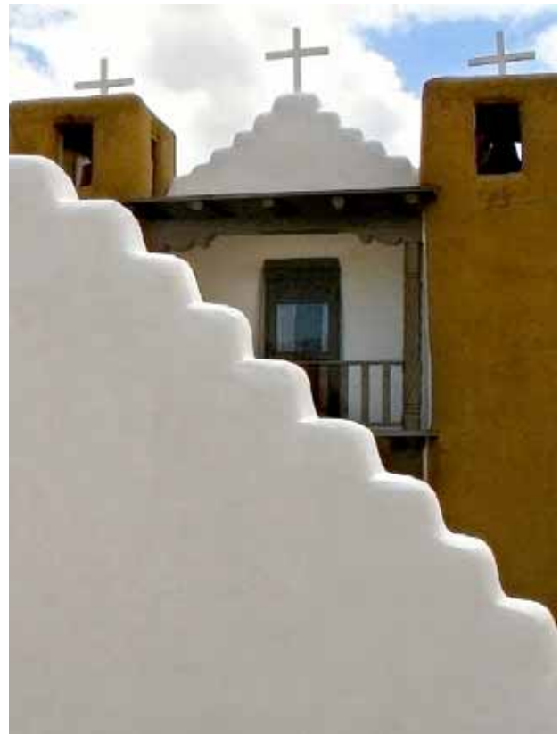
Taos Pueblo First in 2008 Salon Digital Image Architecture Category

Wednesday, April 29, 7PM. Annual Business Meeting and selection of images for I-74 Challenge. We will also plan our program for the next Club year.