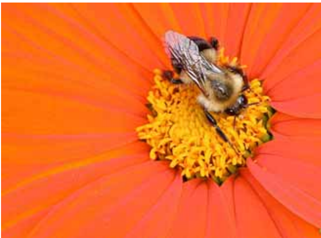
Bee Gathering Nectar Third in 2008 Salon Digital Image Fauna Category

Wednesday, April 15, 7 PM. Deadline for turning in digital images for our April Salon. The categories are the same as last year's and are the following: A: Landscapes and/or Waterscapes. B: People. C: Fauna. D: Flora. E. Architecture. F. General. G: Contemporary/Creative.