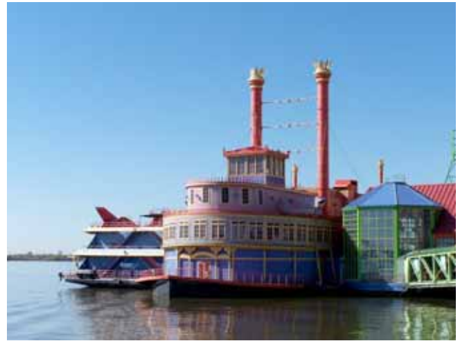
Alton Bell Riverboat HM in Digital Image Complementary Colors Category, April 14, '08