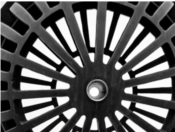
Radial Pattern, CCCC Third Place, I-74 Challenge, Patterns, May, 2008