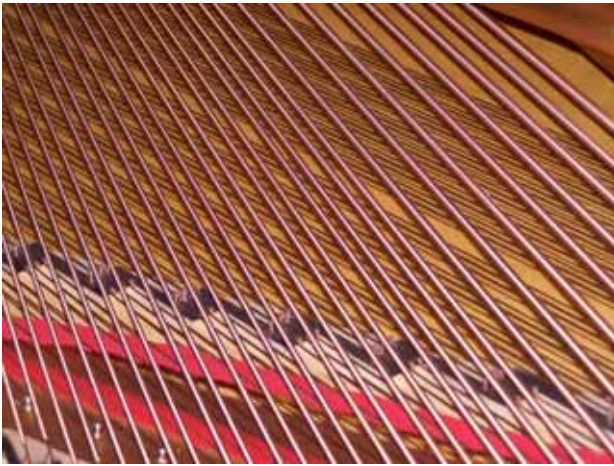
Harmonic Patterns © 2008 Jim Finch, KR Second Place, I-74 Challenge, Patterns, May, 2008