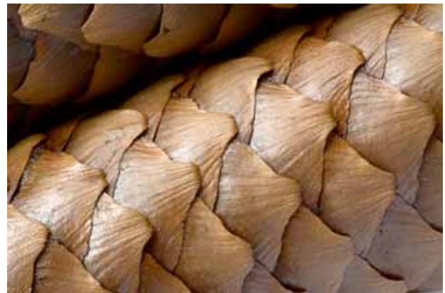
Pinecones, CCCC Fourth Place, I-74 Challenge, Patterns, May, 2008

Please note that the rules for next year's Challenge have been modestly modified. For everyone's convenience, they appear at the end of this Newsletter.