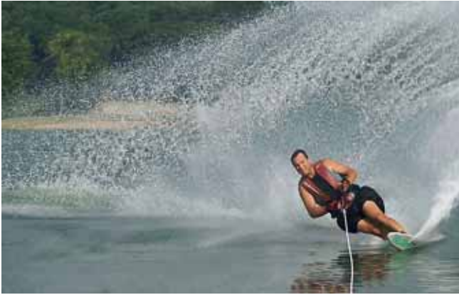
Cutting Edge Honors Image, May 2008 CICCA Individual Salon Pictorial Category