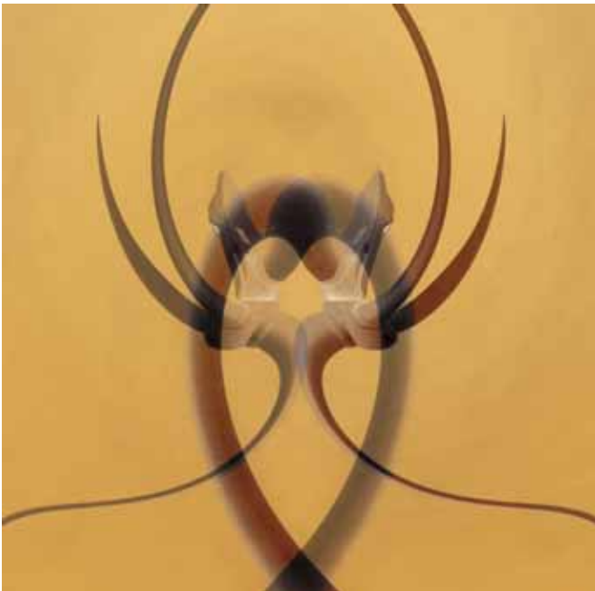
In the Style of O'Keefe © 2008 Hiram Paley Honors Image, May 2008 CICCA Individual Salon Creative/Contemporary Category

Honors Images: Meadow Brook Trail Smear, and also Tulip Swirl, both by Jim Long; In the Style of O'Keefe, by Hiram Paley; The Photographer, by Jean Paley.