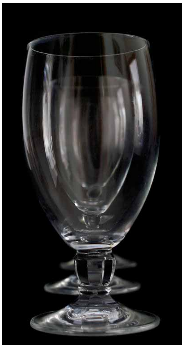
Three Goblets HM in Patterns Digital Category, April 14, 2008

Competition. A. Architecture. B. People. C. Creative/Contemporary. Category C is not a photo-realistic category.