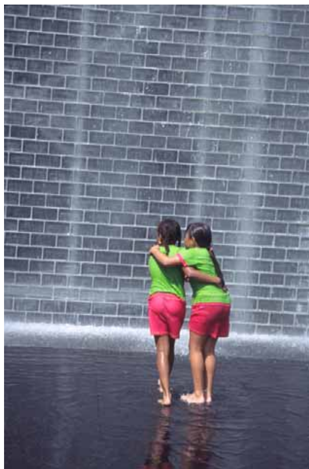
Millennium Park Sisters Fourth Place, Digital Image People Category, 2008 Salon

Monday, March 23, 7:30 PM. Competition. Digital Competition. Digital: A. Time. B. H 2 O. Print: General Print Competition in Small Prints only. Category A, a first time category for the Club, is a non-photo realistic category for this competition.