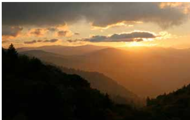
Sunrise Newfound Gap © 2008 Barb Sandell Fourth Place in 2008 Salon Digital Image Landscape/Waterscape Category

Monday, February 9, 7:30 PM. Shawnee Trip Images. Members will show up to 20 of their images taken during the late October Trip to Southern Illinois and Shawnee National Forest.