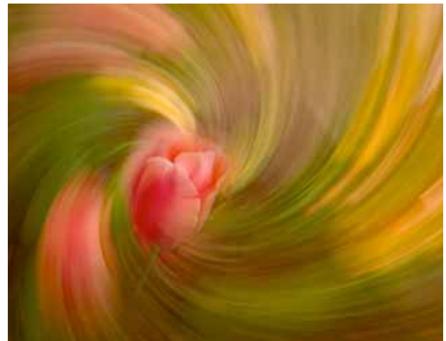
Tulip Swirl

First in 2008 Salon Digital Image Contemporary/Creative Category Honors in Creative/Contemporary Category May 2008 CICC Salon