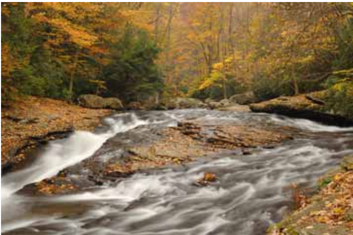
Meadow Run

Best of Show in May 2008, CICCA Individual Salon First in Nature Category