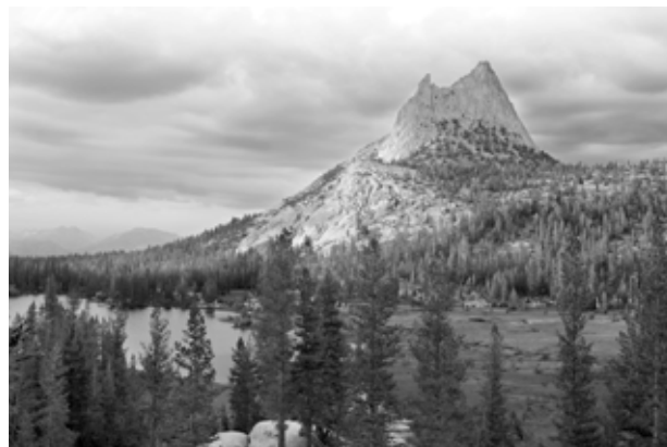
Cathedral Peak First in 2007 Salon Large Print Category