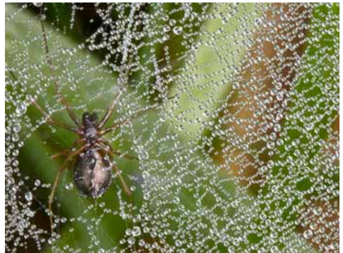
Ground Spider Web First in 2007 Salon Digital Image Fauna Category

Friday, February 15, 4PM. Best in Show Competition, Lincoln Square Village. We will arrange the entries in the 2008 Best in Show Competition for display.