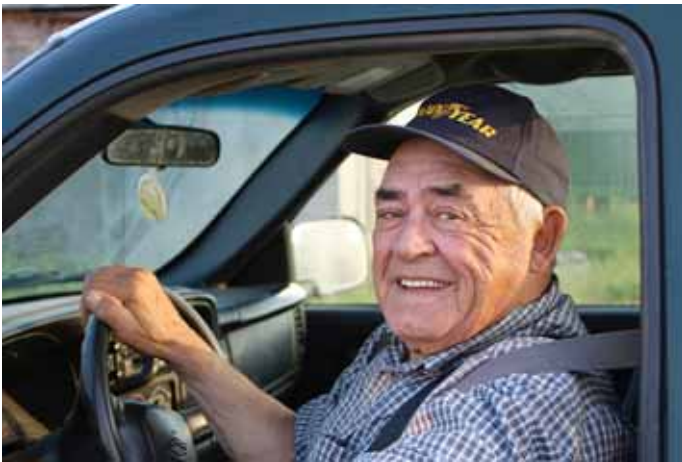
Cow Head Harbor Resident First in 2007 Salon Digital Image People Category

levels, curves, and hue/saturation, and saving the master file. Preparing for projection and printing will discuss requirements for resizing and techniques for sharpening. If we have time at the end, we will also discuss “soft proofing.”