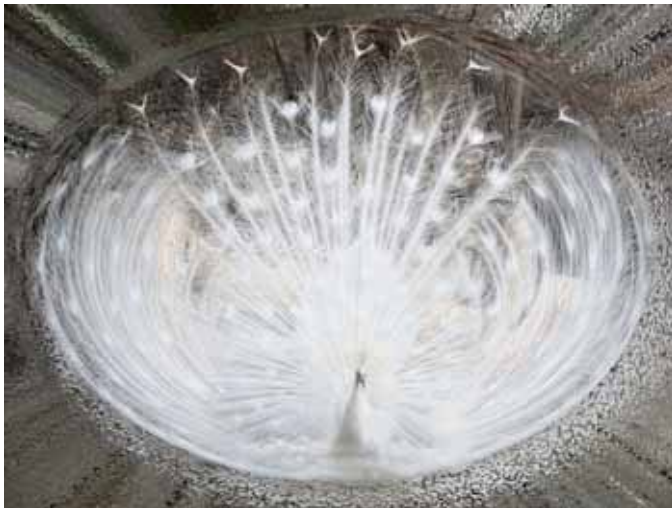
Display First in 2007 Salon Digital Image Contemporary/Creative Category Digital Image of the Salon

At the annual business meeting, the Club drew up a schedule for the new year that will start in September. This was sent earlier to members and is repeated here. Please note that most meetings will be held on Mondays this year.