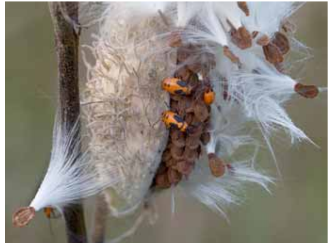
Milkweed Leaf Beetle First in 2007 Salon Digital Image Flora Category

September meetings will be on Wednesdays. After that, all regular meetings will be on Mondays, except for the Salon preparation meeting on April 16 at Jim Long's, the Salon itself, the Annual Meeting and I-74 Image Selection meeting, and the I-74 Challenge, and any special events.