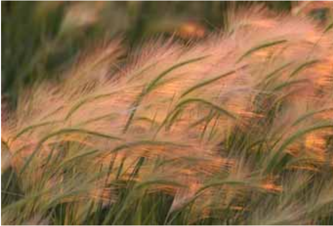
Soft Grass © 2007 Barb Sandell First Place, I-74 Challenge

Koda Roamers, the 19 slides were digitized and the entire competition was done as a digital competition. To simplify the judging, those 14 images that received a score of 12 or 13 were considered for the top five places (the nine that did not receive a place were given honors status). Any image that received an initial score of 10 or 11 was deemed an honors image. At the end of the evening, places one through five were awarded, and there were additional 37 honors images.